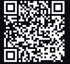
TRB500 360° VIEW